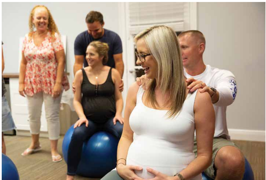
The Indian River Healthy Start Coalition offers birthing classes and other educational resources.